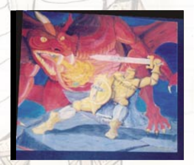
Above: A painting I did for an art class project in the early 1990s. This piece illustrates Ephesians 6:11-18 showing a warrior suited in a golden suit of Armour battling a fire breathing dragon. This is one of the first peices that gave me an idea for a shory and will later develop into the Mekonnen character and his adventures.

Another reason is the fact that many people of the African diaspora look up to Ethiopia as a model of freedom and independence, being the only African nation that has not been colonized by Europeans. Also being the first, and right now the only African nation to recognize Christianity to be its state religion. They also have close historical and spiritual ties to Judaism and the nation of Israel going back to almost 3000 years ago, probably beginning with the visit of the Queen of Sheba to Jerusalem to speak to King Solomon (some experts speculate Judaism may has enter the Ethiopia region since around the time of Moses). Not to mention that The Ethiopian Orthodox Church, monarchy and government claim to have the sacred Ark of the Covenant in their country. In the Caribbean Ethiopia is venerated and recognized as being mentioned in the Bible many times and some churches and the Rastafarians believe the Garden of Eden was in Ethiopia. Although I don't agree with some of the beliefs