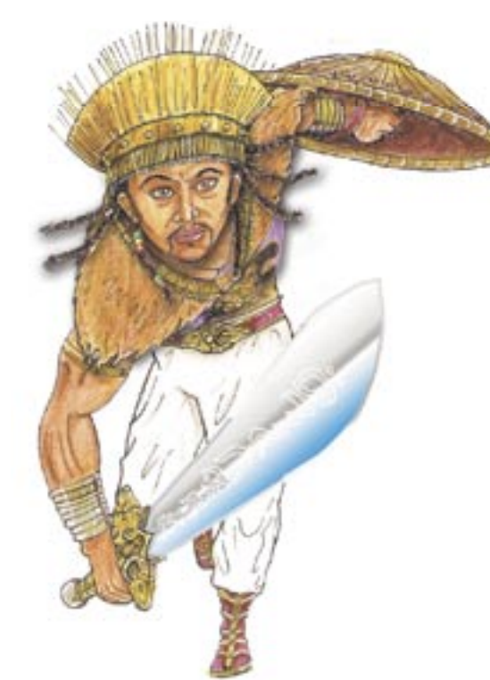
Mekonnen Sofaniyas, warrior in the Kingdom of Aksum, 6th century AD

Mekonnen is a warrior in the royal court of the Kingdom (Empire) of Aksum, one of the first Christian kingdoms of the world. He lived during the prosperous reign of King Amida, also known as Emperor Gebre Meskel (Servant of the Cross), who reigned in the mid 6<sup>th</sup> century AD. Mekonnen